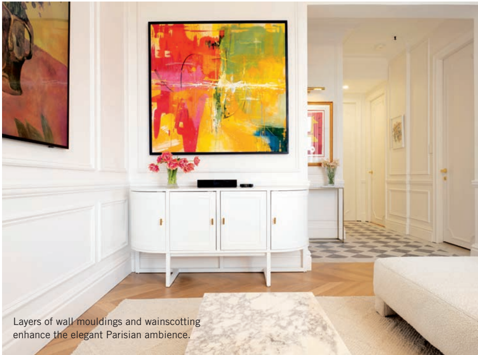
Layers of wall mouldings and wainscotting enhance the elegant Parisian ambience.

The stunning marble chequered tiles and herringbone floorboards add much-needed warmth, while a modern lounge in a neutral tone and marble coffee table create a space that looks like it's come straight from a fashion house in Milan.