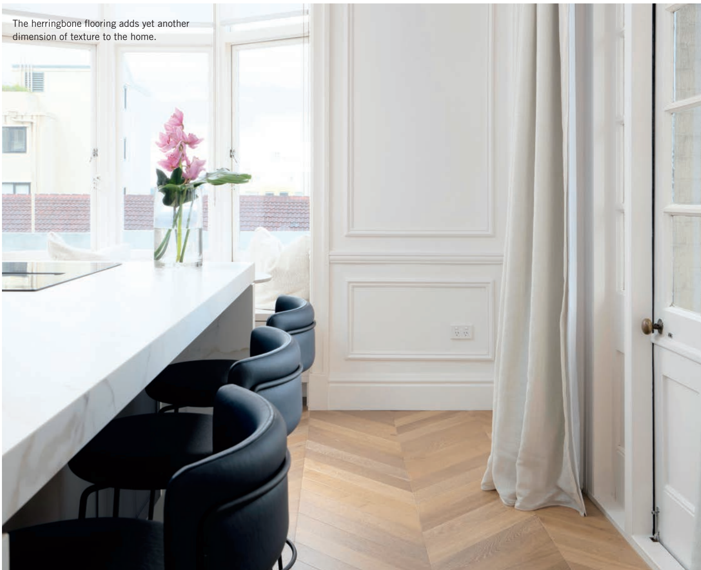
The herringbone flooring adds yet another dimension of texture to the home.

It is wonderful what you can achieve in a small space with thoughtful design. Keeping the flow from start to finish, it's the details that truly bring this home together. intrimmouldings.com.au