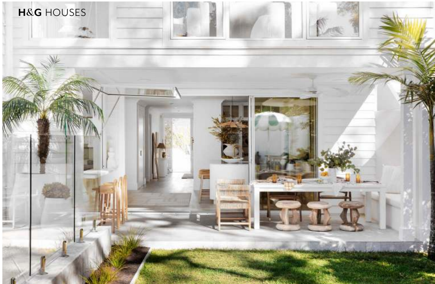
OUTDOOR DINING Above and below left The outdoor dining area is perfect for relaxed family dinners – or open the gas-strut servery window to create a bar and the whole area moves into entertaining mode. Myles dining table, House of Orange. Tablecloth and napkins, Bonnie and Neil. Glassware and cutlery, Freedom. Bench seat, Byron Bay Hanging Chairs. Tsuna stools, Uniqwa Collections. Dining chairs, Lounge Lovers. Bobby barstools, DesignByThem. Ceiling fan, Beacon Lighting. Servery window, Stegbar. LAUNDRY Custom joinery in Dulux Cat Mint, Carrera by Design. Shaws Lancaster single butler sink, and Mizu 'Drift' gooseneck tap in Brushed Gold, both Reece. Stool, Lounge Lovers. FIREPIT/FRONT GARDEN Filled with white crushed pebbles, this circular cut-out in the front lawn forms a perfect firepit and conversation corner. Firepit, Yagoona Design Australia. Armchairs, Byron Bay Hanging Chairs. Umbrella, Basil Bangs.