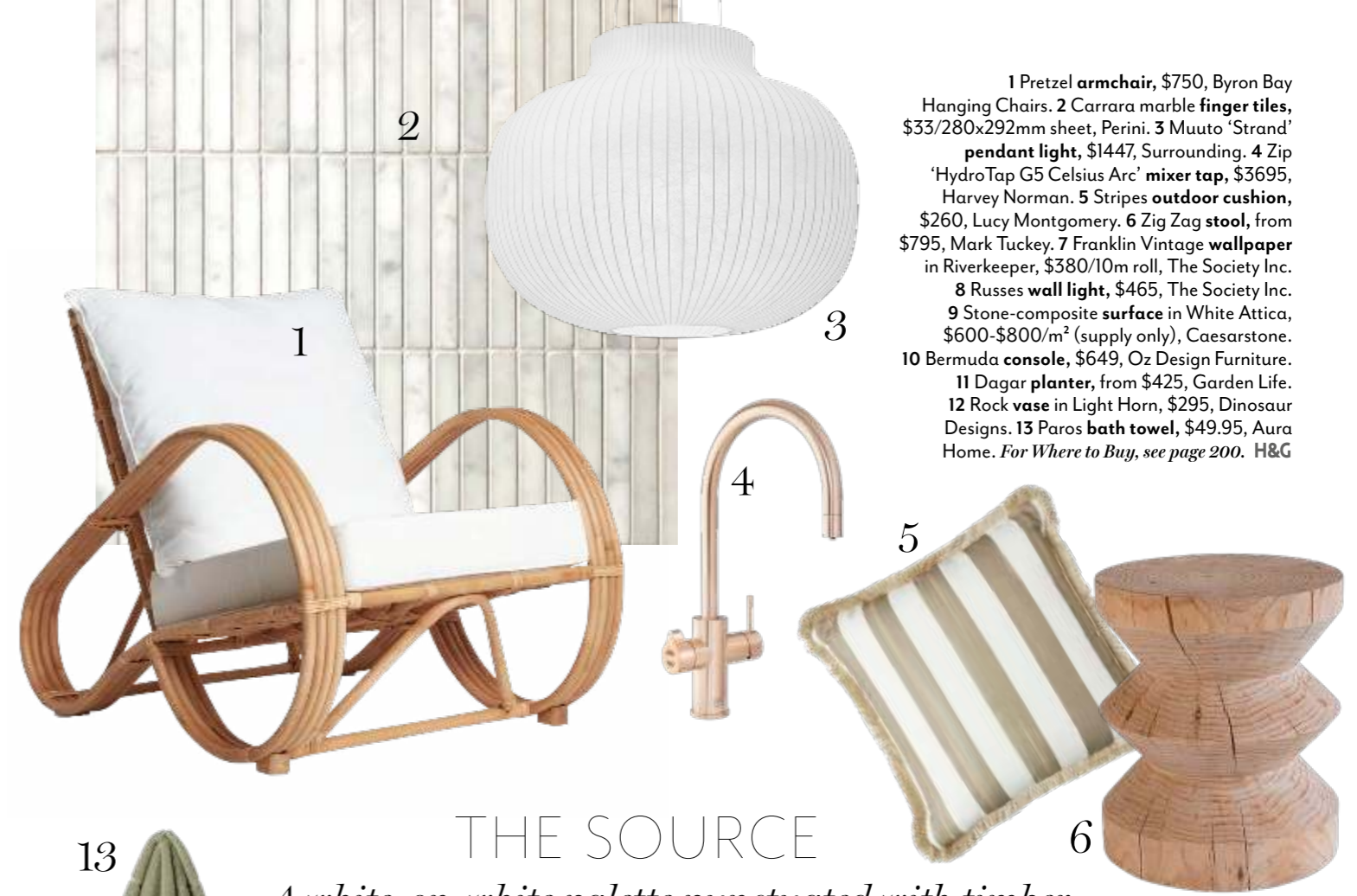
1 Pretzel armchair , $750, Byron Bay Hanging Chairs. 2 Carrara marble finger tiles , $33/280x292mm sheet, Perini. 3 Muuto 'Strand' pendant light , $1447, Surrounding. 4 Zip 'HydroTap G5 Celsius Arc' mixer tap , $3695, Harvey Norman. 5 Stripes outdoor cushion , $260, Lucy Montgomery. 6 Zig Zag stool , from $795, Mark Tuckey. 7 Franklin Vintage wallpaper in Riverkeeper, $380/10m roll, The Society Inc. 8 Russes wall light , $465, The Society Inc. 9 Stone-composite surface in White Attica, $600-$800/m 2 (supply only), Caesarstone. 10 Bermuda console , $649, Oz Design Furniture. 11 Dagar planter , from $425, Garden Life. 12 Rock vase in Light Horn, $295, Dinosaur Designs. 13 Paros bath towel , $49.95, Aura Home. For Where to Buy, see page 200. H&G