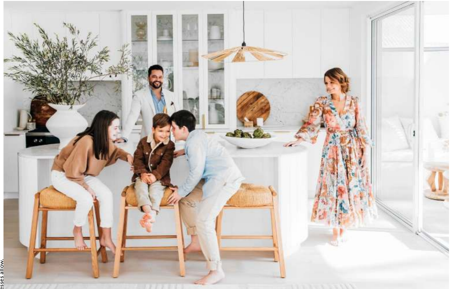
Portrait photograph by River Bennett. Paint colours are reproduced as accurately as printing processes allow.